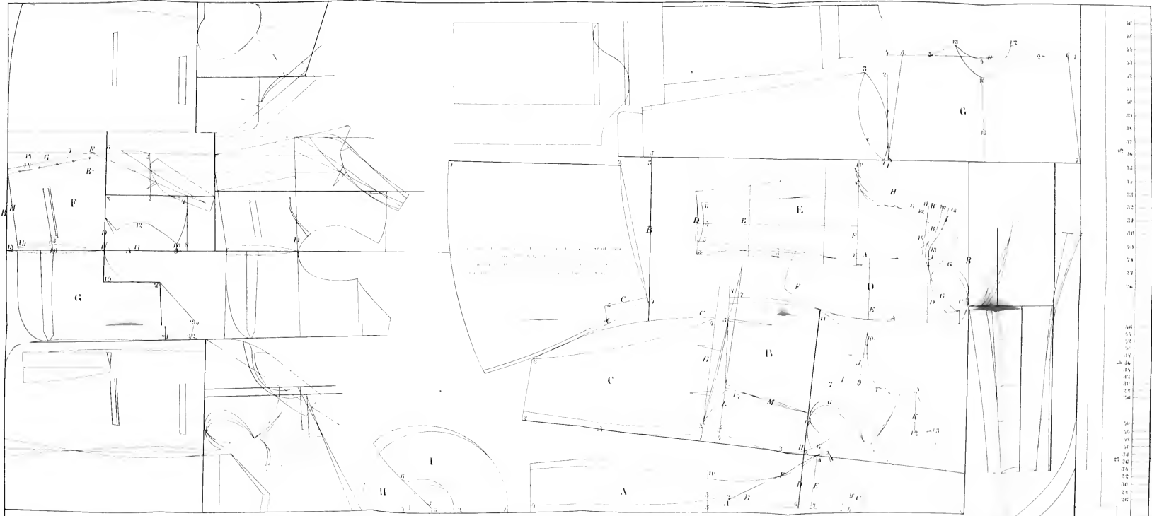
THE GREAT BALANCE MEASURE SYSTEM, INVENTED BY WM BROCKWAY OF NEW YORK.